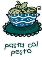
pasta col pesto